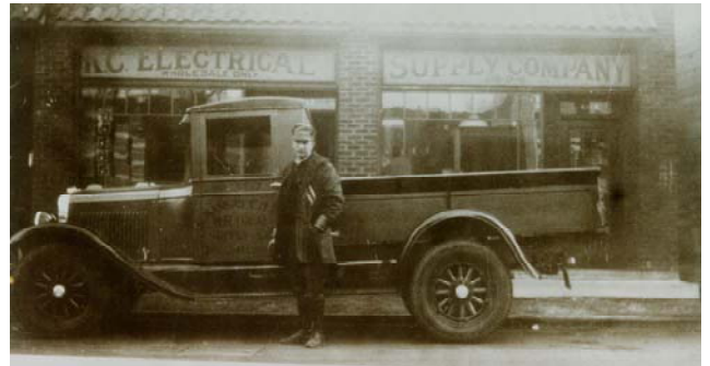
Serving Kansas City since 1927.

If you need this minority participation on a job, be sure and ask for details when you call.